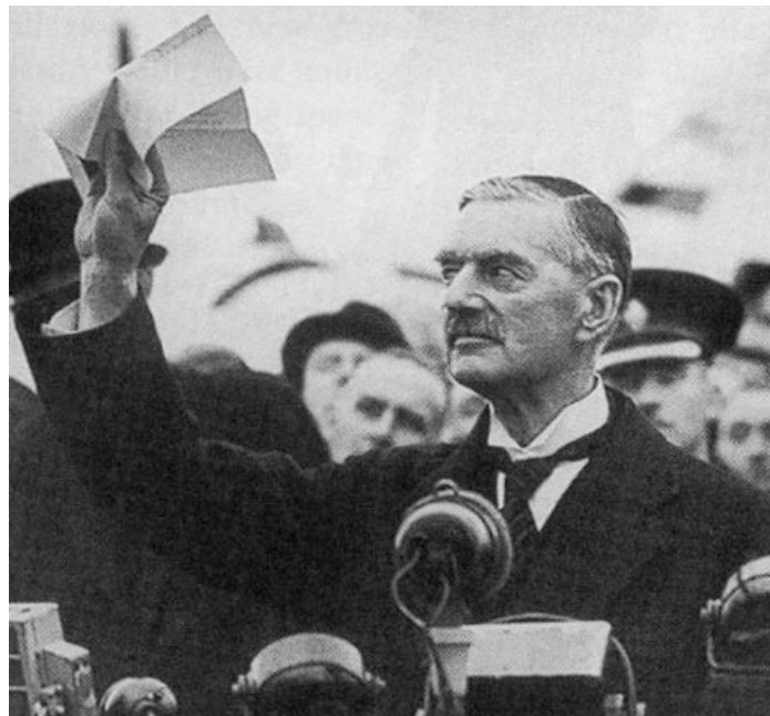
Arthur Neville Chamberlain in 1938, at Munich Betrayal , then brandishing the signed document upon his return: Peace is saved !