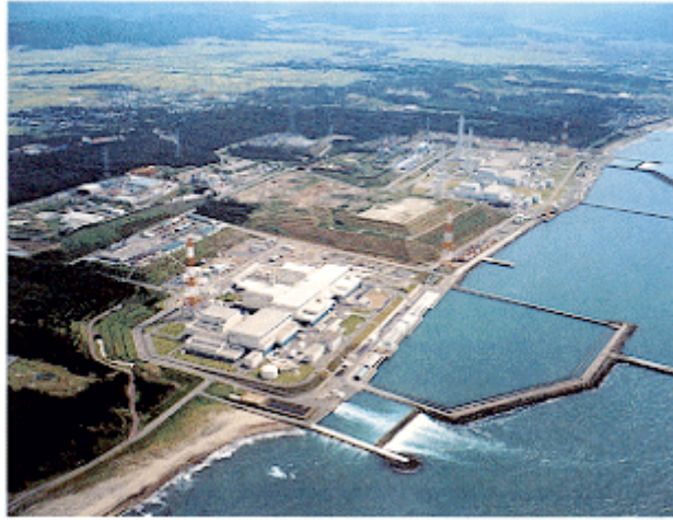
The Kashiwazaki-Kariwa plant

That would have been a catastrophic event where the damaging effects of the quake itself and radiation leaked from the plant reinforced each other.